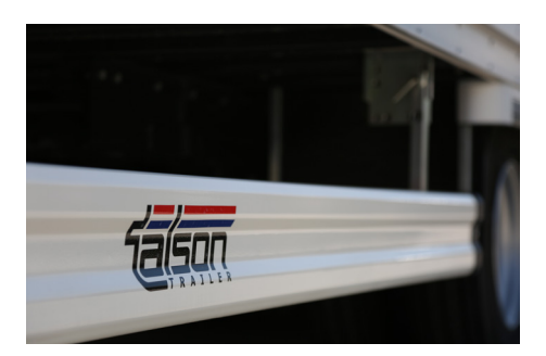
SIDE UNDERRUN PROTECTION The side underrun rail is a lateral protection device made of KTL coated steel profile which can be folded upwards for easier access to vehicle when needed..