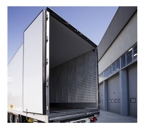
FLOOR PROTECTION PLATE The entrance of the trailer is lined with a 600 mm, non slip steel plate.

A component of patented Talfix systems, the double deck bar with 1 daN capacity each, allows you to create a second tier inside the vehicle for maximum carrying capacity. Plus, the height of the deck can be adjusted for maximum efficiency and profitability.