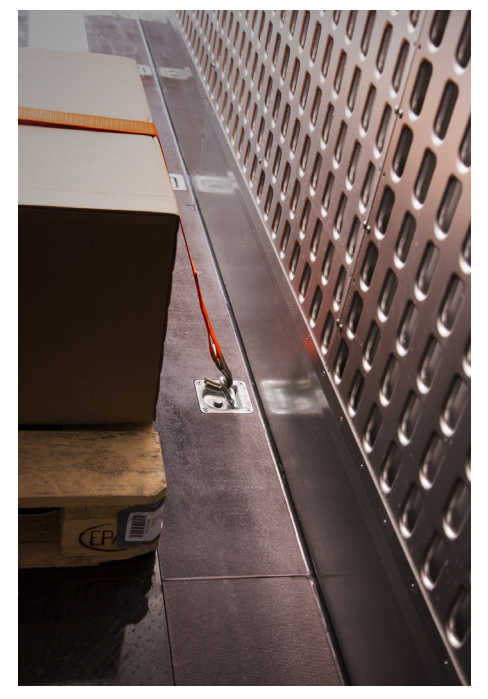
INTEGRATED LASHING RINGS Talson trailers are equipped with 26 lashing rings, 13 on each side, discreetly integrated into the vehicle floor to anchor heavy weights for maximum load security.

Talson door is a container style door, designed to provide maximum strength at the rear and optimum load security. It improves durability and handling of the trailer. Also it can be easily equipped with electronic lock systems to enhance security.